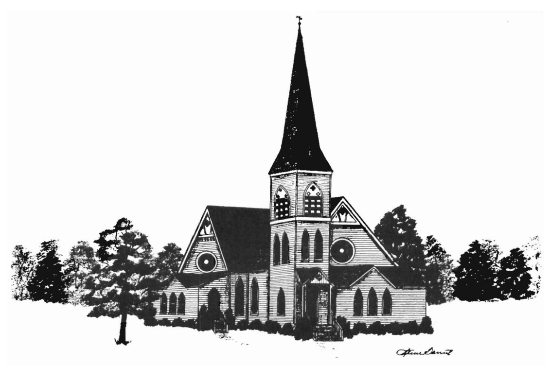
Methodist Church, 1889 Church Street & Price Avenue Demolished, 1921