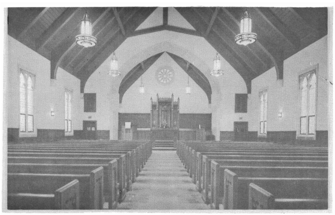
First United Methodist Church Prestley Mill Road Interior