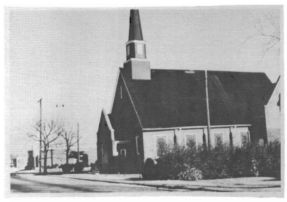
First Methodist Church Church Street & Price Avenue